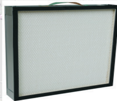
H13 HEPA Filter