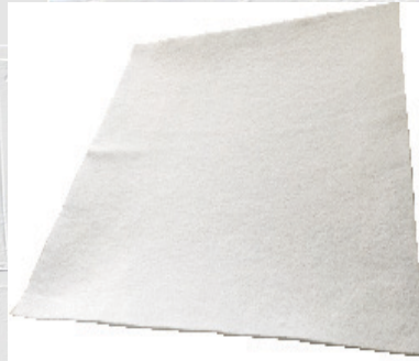
G4 Primary Filter